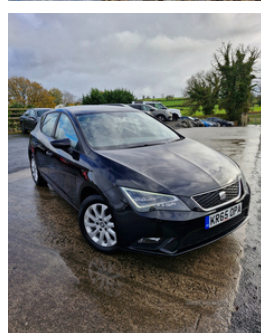
SEAT Leon 1.6 TDI SE 5dr [Technology Pack]

DECEMBER 2015 1.6L DIESEL MANUAL 2 KEYS MIDNIGHT BLACK METALLIC PAINT 107,497 MILES MOT UNTIL SEPTEMBER 2025 FULL SERVICE HISTORY ZERO ROAD TAX LOW GROUP INSURANCE £6,250