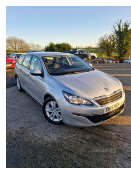
Peugeot 308 1.6 BlueHDi 120 Active 5dr

2015 1.6L DIESEL MANUAL 2 KEYS SILVER METALLIC PAINT 107,493 MILES WILL COME WITH 12 MONTHS MOT SERVICE HISTORY ZERO ROAD TAX £4,995