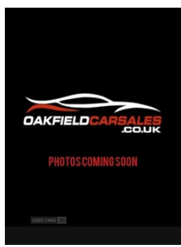
Range Rover Velar 2.0 D 180 S 5dr Auto

2019 2.0L DIESEL AUTOMATIC SANTORINI BLACK METALLIC PAINT ONLY 46,329 MILES WILL INCLUDE 12 MONTHS MOT £23,995